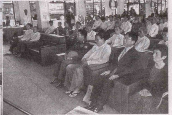
Lt-Gen Myint Swe of Ministry of Defence speaking at launching ceremony of