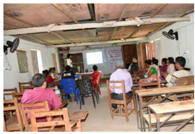
Learning about Disasters at Workshop

After the Nepal Earthquake in April 2015, SEEDS Asia handled emergency support to provide subsistence goods and educational kits. Then, SEEDS Asia has been conducting DRR Workshops with the local NGO, Centre for Disaster and Climate Change Studies (CDCCS), as community DRR activity support for "Build Back Better" reconstruction.