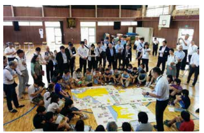
Observation of a Disaster Risk Mitigation Class

with SEEDS Asia in 2013, and a lecture by the Board of Education in Kesennuma City. They also observed Disaster Risk Reduction classes at Hashikami Elementary School developed based on SEEDS Asia's project on support for the people affected by the Great East Japan Earthquake & Tsunami conducted until last year, visited Koyo High School in Kesennuma City, the disaster remains of the earthquake, and listened to the lecture by the Board of Education in Kesennuma City.