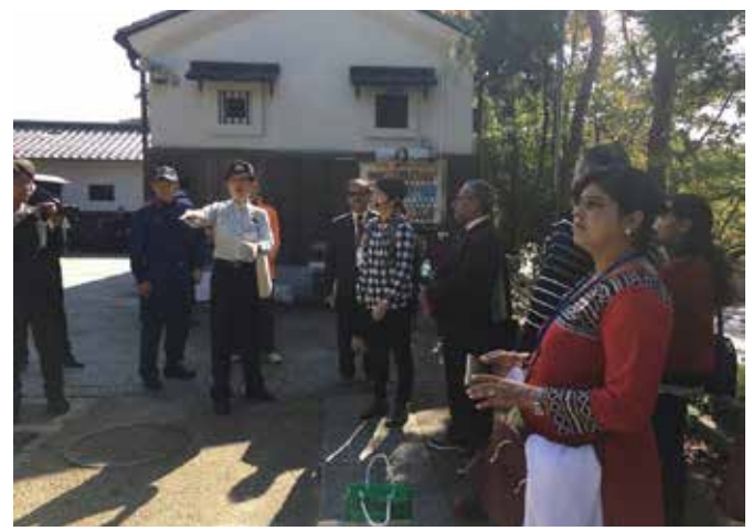
Visit of Network Group on Water Facilities for Disaster Prevention on Cultural Assets and Their Vicinity

On the final day, the delegates made a presentation of "the message we would like to convey to children in Varanasi" to be put on student's newsletter called "Prahari" in order to be disseminated to all over the city as well as reviewing what they learned during this visit. Then, action plan was made based on the training, and presented what they would like to implement at CSs utilizing what they learned in the training. Many very motivated comments were heard from the delegation as the following: "We were very impressed with the city without any trash on the road, and we understood that the high capacity level of community people helped to develop the City of Kyoto. Without depending on public (government) help, we would like to start promoting activities on environment and DRR at our own schools."