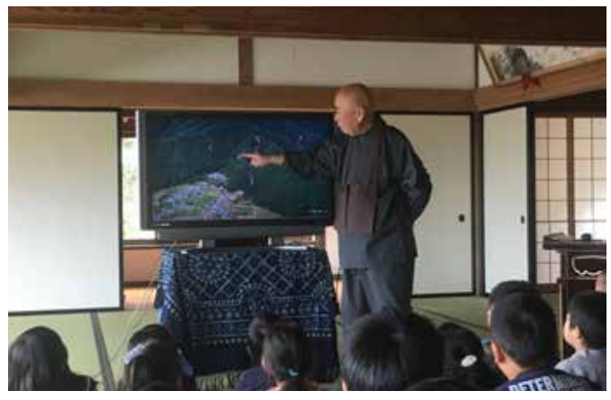
Explanation by the Temple Priest

This was the first trial of "DRR Orienteering" by the school. The teachers must have gone through challenges, but this will definitely raise awareness of DRR among the students.