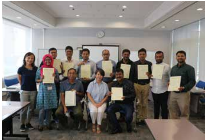
Japan Study Visit

It was new and surprising for the delegation to observe that local residents take initiative in DRR voluntarily and proactively, that city government issues newsletters and uses it as a tool to raise disaster awareness, and that news organization strongly recognizes the role of media in DRR and continues to write about disaster and DRR. Importance of community DRR has been discussed continuously in Dhaka as well but it was understood much better through the Japan visit. We greatly thank those helped us realize this program for their kind support and cooperation.