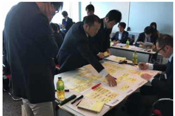
Participants Summarizing Discussion