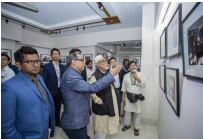
DRR Photo Exhibition Gallery

On 9th to 11th February, SEEDS Asia and Dhaka North City Corporation (DNCC) organized a photography exhibition on DRR, the first in Bangladesh, at the World Literature Center in Dhaka. In a photo competition on DRR "Tell Us Your Story" launched last November, we received over 250 photos from professionals to amateurs, of which 50 distinguished photos were selected for the exhibition. Many of the participants were amateurs whose photos captured risks and vulnerabilities in their daily lives. It was also a unique opportunity for the city authorities to know how the citizens look at their city. The exhibition also showcased 28 pictures of the Great Hanshin Awaji Earthquake from the Kobe Newspaper to share the experience, devastation, reconstruction, and people living with the disaster. As many as five hundred people visited the three-day exhibition. Spectators left comments such as "Innovative and artistic way to think of urban issues", "most of the photos from Bangladesh represents hazards. It would have been even better if we had positive photos like the ones of Japan", "Very common scene in Dhaka but nobody deeply thinks about its risks or how to solve these problems. Thanks for organizing such a beautiful awareness raising exhibition". DRR communities also engaged in this event by introducing their activities to the spectators. The ten best photos will be exhibited in JICA Kansai International Center from 11th April. Please visit the exhibition!