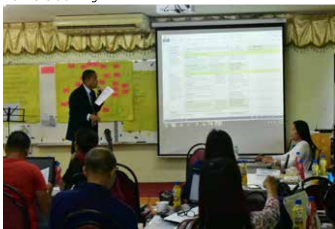
Training of Trainers on DRR Education in Department of Education Region