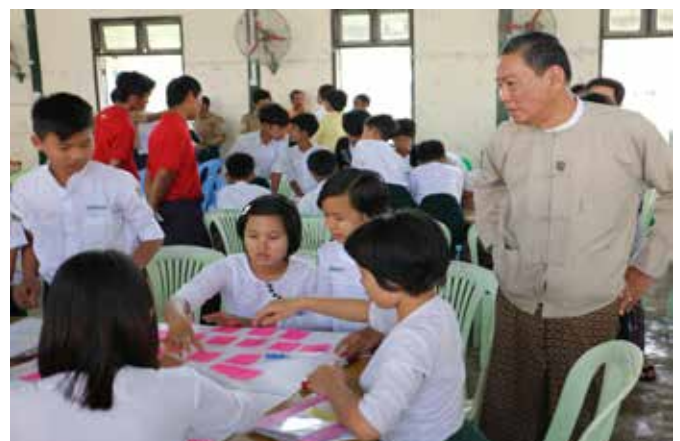
Students Exchanging Opinions about Tsunami Simulation Exercise with Myanmar Engineering Society Adviser

On 27th and 28th January, tsunami evacuation workshops