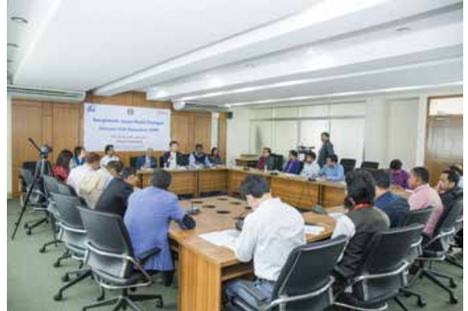
Media Dialogue on DRR