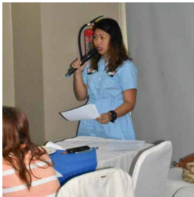
Operations Guideline Workshop

On 12th and 13th February, two-day follow-up workshop for School DRRM Operations Guideline and teachers' training design preparation was conducted with the School Disaster Risk Reduction and Management Instructing Team, twelve in total, in Cebu City. This was to provide an update and ensure that the team will improve the quality of the content to make more effective School DRRM Operations Guideline, covering four thematic areas (Prevention and mitigation; Preparedness; Response and Recovery) of DRRM, including the creation of School DRRM team organizational structure. During this workshop, the teachers' training design was also drafted for the upcoming training this April. Each was assigned a certain topic to discuss, including the session guides for the sustainability of the project. All agreed to conduct another workshop this March for critiquing the session guides by the representative from DepEd Region 7.