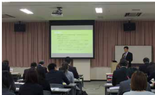
Appointed DRR School Teacher Presenting DRR Education Activity

Among the appointed DRR schools, Ogawa Elementary School presented their instructions using "Kokoro Tsunagu (Bridging Hearts)" – the printed DRR Education materials, and Hikami Junior High School presented their unique event on DRR Education. The representing teacher from Hikami Junior High School encouraged the attending teachers by saying: "With the help of the community and the City, we came to hold our second event of DRR Education classes and drill. The first step must be very challenging, but, as you start moving forward, it will be possible to establish this as a sustainable event".