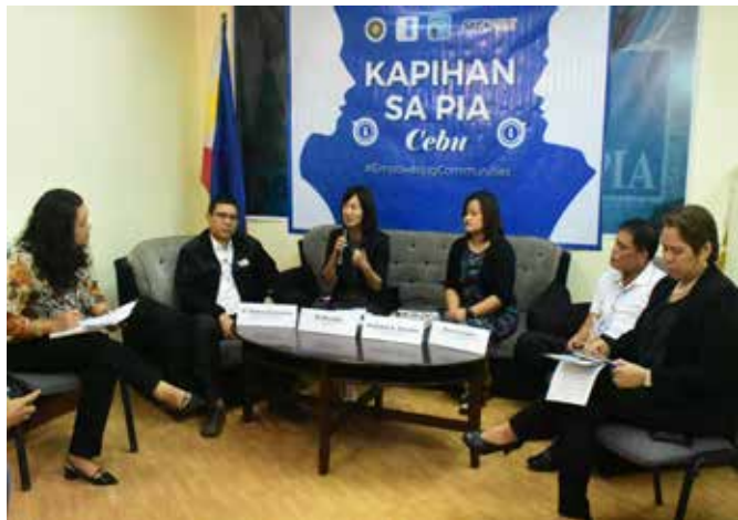
Radio Panel Discussion

their intention to witness the teacher's training this April. This event was also aired on delayed telecast in Sky Cable, channel 53.