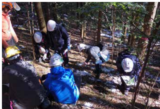
University of Hyogo Students Conducting "Forest Check-up" Activity in Tamba Mountain

The students from Keio University were divided into three groups, made theme-based field visits and presented their suggestions and proposals to the City. Those from University of Hyogo visited and listened to those who