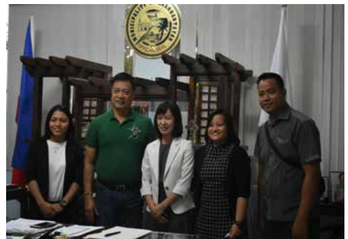
Memorandum of Understanding Signing with Mayor of Daanbantayan