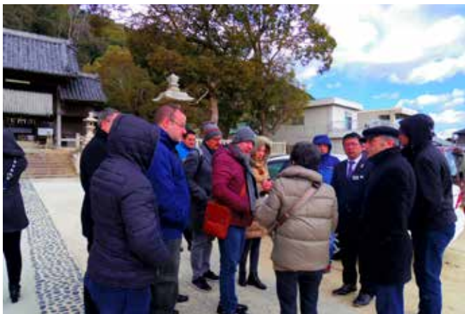
Participants Listening to DRR Education Lecture by Awaji Education Office, Hyogo Prefectural Board of Education

On the last day, with the facilitation by an expert, the participants discussed and presented their detailed action plans and proposals to their office about the teacher training system and "DRR Education Handbook".