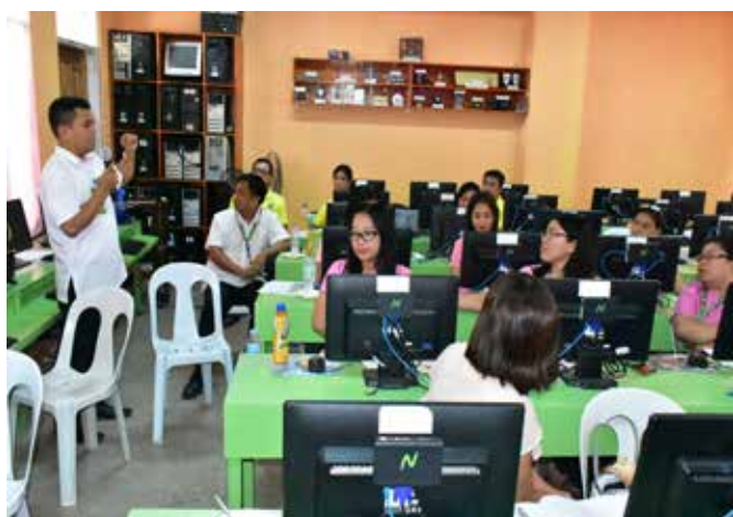
Safety Inspection Meeting

On 14th February, the third coordination meeting for the safety inspection at Daanbantayan was conducted at the community hall of Poblacion community. The meeting was