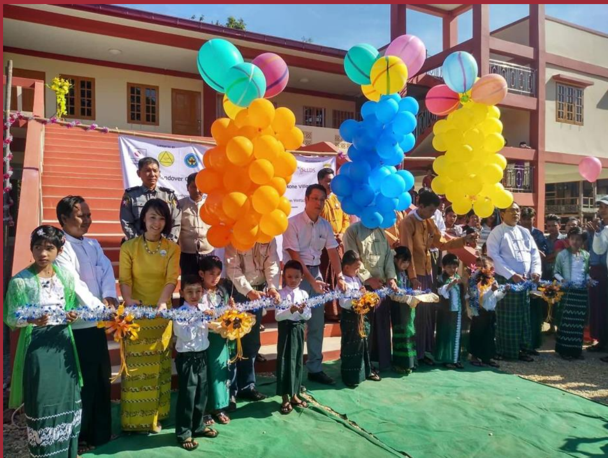
学校兼シェルター 引き渡し式典の様子 (ミャンマー) Handing-over ceremony of school cum shelter (Myanmar)