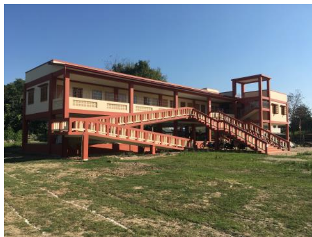
Completed the construction of the school cum shelter of Nabekone Village

SEEDS Asia develops human resources to make resilient village with utilizing the school cum shelter as the next step. Please follow the reports from Nabekone Village delivered continuously. SEEDS Asia deeply appreciate your continuous warm support. Once again, we heartily thank you to all supporters.