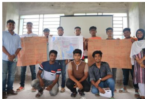
Youth club of Kha para area

The leader of the youth club has proactively participated in networking meetings with other DRR communities in the city. Unlike the youth club, the other DRR communities are based on registered citizens' group, or society. The youth club leader learned challenges the societies face in their respective communities, management strategy, and the government's registration system as a society. Learning from those societies, the youth club had tried to form one in Kha para area and get it registered, promoting the idea to leaders and adult members of the area. Having witnessed good works done by the youth club on DRR, the local leaders finally agreed to establish a Kha para society to make the area better place to live and to extend support to the youth club for their DRR and the other activities. Kha para society decided to work on waste collection issue in the area to start with. The youth club demonstrated a great example of how the young ones can bring a change to a community and how DRR can be the catalyst in such positive changes.