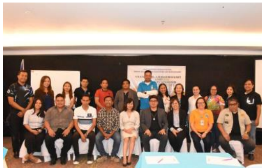
Year-end assessment and action planning meeting

On December 13th, SEEDS Asia together with Cebu Provincial DRRM Office organized a year-end assessment and action planning meeting in Cebu City. In total, around 30 people participated from DepEd Region 7 Office, pilot schools, pilot division offices, and LGUs from 10 pilot areas of the project. Each participant presented achievements of their school DRRM of the year, shared challenges with other participants, and discussed improvements for the coming year. Pilot schools told that they “will attend community sessions, give awards and recognitions to gain commitments of stakeholders”. DepEd Division DRRM Coordinators said that they “will institutionalize the programs and activities not to disrupt classes.” LGUs told that they “will properly coordinate to improve communication with schools.”