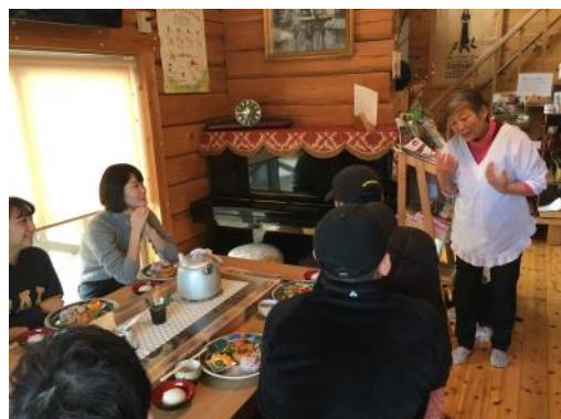
A restaurant owner of Tamba City explaining the lunch made with local products

The professor of the zemi was keen on regularly incorporating Tamba City study tour into his program from next academic year. He proposed that an orientation for briefing about Tamba City can be also set in the program in earlier semesters of the yearly schedule, for effective visits. This is a great chance of inviting many more students to know the greatness of Tamba City!