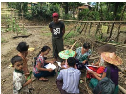
Making the village DRR map

The construction of school cum shelter has been completed now but still there are things to learn for utilizing the shelter effectively as, space and supply are limited at the shelter. Through the 8th workshop, Nabekone village DRR committee members learned necessity of the list of persons in special need at times of disaster and sharing the list in the community. At the 9th workshop, the DRR committee members and SEEDS Asia staff visited every household in Nabekone village and input the detail information of each household for prioritizing the space for the most vulnerable houses. The information will be kept and managed as household cards to utilize evacuation plan. Additionally, the final DRR map which provides more advanced information than the one made at 2nd workshop such as: the record of housing types, heavy flood in 2015 and 2016, the spots where drink water can be caught and toilets can be used has been almost completed.