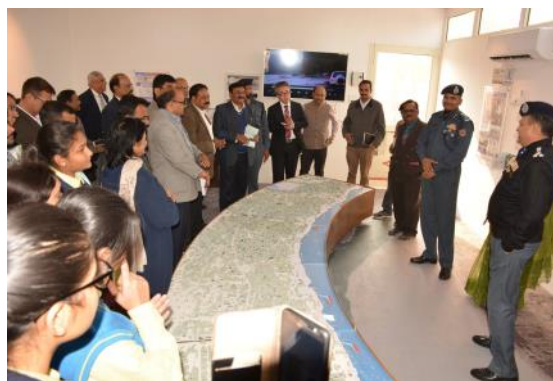
DRR-CAP inaugurated in December