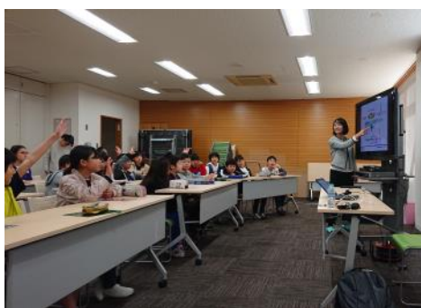
Students of Tamba City Municipal Aogaki E.S. leaning about Nabekone Village

On 26th November, SEEDS Asia visited Tamba City Municipal Aogaki E.S. to introduce to the 6th graders the situation surrounding Nabekone Village in Hinthada Township, where the school furniture from former Tozaka E.S. is presented to. Aogaki E.S. is a new school established as a result of merger of four schools including former Tozaka E.S (please refer to https://www.facebook.com/pg/SEEDS-Asia-206338119398923/photos/?tab=album&album_id=2233729616659753 about carrying out the furniture).