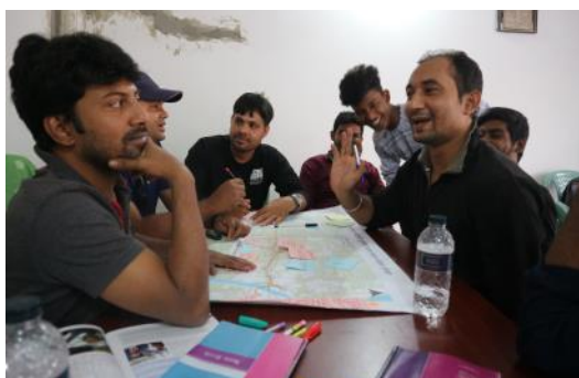
The new DRR community in Kallyanpur making a map after their town watching

Since the DRR leader training in June 2017, the model communities have continued implementing their action plans. To introduce some of the recent ones, in Monipuripara community in Ward 27, DRR leaders conducted sessions on fire prevention and firefighting for small restaurant owners and employees as there are many such restaurants in the area that use gas stoves all the time and the dry winter air increases the risk of fire. Because it's difficult for those small scale restaurant owners to leave their restaurants for a several hours, the session was given on sites as the DRR leaders visited the place to another in their area. The on-site DRR sessions were very effective to raise fire disaster awareness in the community and urge people to take actions as we saw that some restaurant owners voluntarily purchased fire