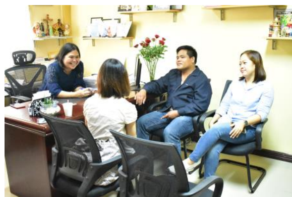
Meetings with Schools Division Superintendent

SEEDS Asia had meetings with Schools Division Superintendents (SDS) of DepEd Pilot Divisions from November to December. Japan Study Visit which will take place in 2019 was discussed. SDSs gave suggestions about its contents such as they “want to have interviews and focus group discussions for region, division, district and school levels”, “want to visit Hyogo Prefectural Board of Education (Hyogo BoE) and schools in order to witness sustainable DRRM initiatives”, “want to know the process of how Hyogo BoE established their current school DRRM”, etc. SEEDS Asia will finalize an itinerary based on given suggestions.