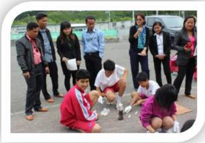
Observing an actual DRR education class at Koizumi Junior High School in Kesenuma City. Students cooking rice using soda cans and milk carton cut-outs

Education Curriculum. To address this, a 2-day DRR Education Integration Workshop was organized on May 28-29, 2015. The Workshop provided a chance for the members to collaborate in