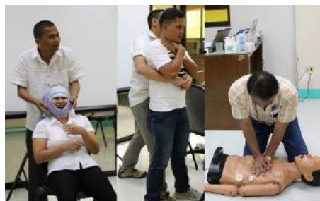
Basic First Aid demonstration - learning through first-hand experience