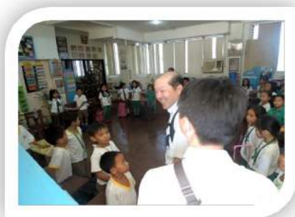
Hyogo BoE visit at City of Bogo Science and Arts Academy (CBSAA)