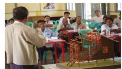
Capacity building training of teachers (Myanmar)

schools and communities while establishing a model of sustainable DRR activities. Currently, SEEDS Asia is working on opening DRR Activity Centers, which will be the DRR capital establishments where local governments, schools and the communities will collaborate to further enhance their DRR activities. Also, SEEDS Asia is a member of Myanmar Consortium for Capacity Development on Disaster Management funded by USAID, which is implementing a project on capacity development in partnership with various government officials and academic representatives in the DRR field.