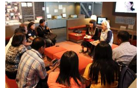
Core Team listening to the story of an affected person during the Kobe Earthquake that occurred in 1995 and imparting valuable lessons to cope with a disaster