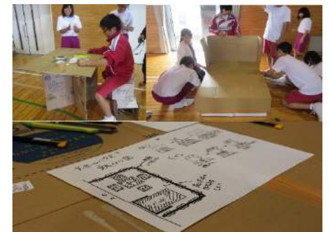
Koizumi Junior High School students empowered by allowing them to plan for the evacuation area in their school. Lay-out plan by their student team leader and use of cardboard as table, bed and for partition purposes.