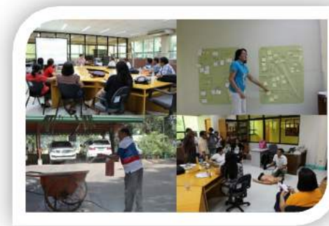
Core Team members undergoing DRR capacity building training