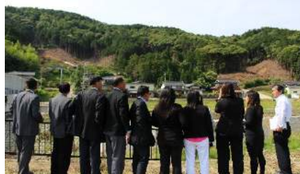
Observation of landslide and sediment flooding damage in Tamba City