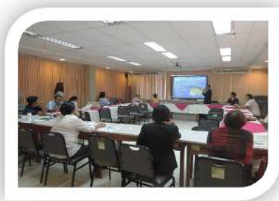
Steering Committee creation meeting with Hyogo BoE

(Daanbantayan Municipality), and then rolling out the models to other areas of Cebu Province with seven (7) as Promotion Schools. The system establishment requires the creation of the Steering Committee which will serve as the decision-making body of the Project. Subsequently, the Core Team is identified that will be the core trainers for the Model and Promotion Schools for DRR Education.