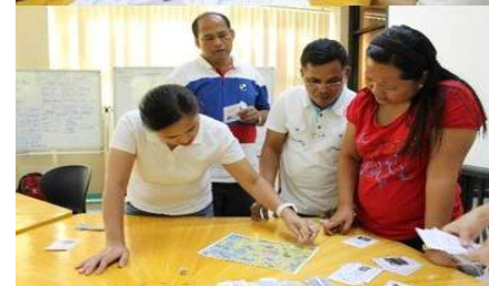
DRR Card Board Game: The Millionaire's Game related to DRR