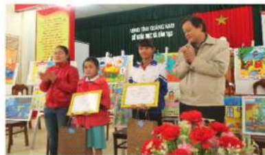
DRR poster-making contest in school (Vietnam)