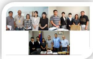
LGU Coordination Meetings