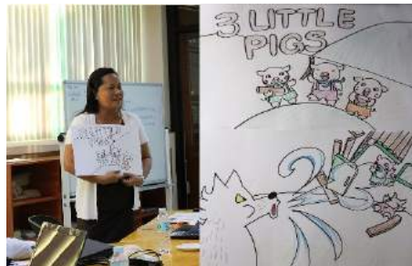
Experiencing DRR Storytelling: The Three Little Pigs - learning about DRR in a fun way