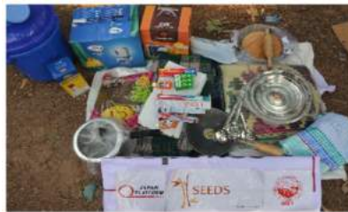
Family Kits provided to earthquake-affected residents in rural areas (Nepal)

After the strong earthquake with a magnitude of 7.8 that occurred on April 25, 2015, SEEDS Asia, in collaboration with SEEDS India and a local counterpart that is funded by Japan Platform, started a project to distribute "Family Kits" that were needed for safe and hygienic life in affected rural areas where other organizations' support did not reach. Following the initial emergency relief, the team is going to provide learning kits and basic DRR knowledge to school children this July.