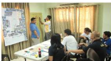
Meeting with the community for town watching and hazard mapping (Makati City)

Funded by Japan's Ministry of Foreign Affairs (MOFA), the Makati Project by SEEDS Asia focuses on DRR Education and awareness-raising of the children and communities in the City. In partnership with Makati City Government, currently town watching and hazard map making activities are being conducted. These activities involve not only the City officials but also people of the communities and will be utilized in making the Mobile Knowledge Resource Center, a truck that will visit each community to share various learning resources on DRR.