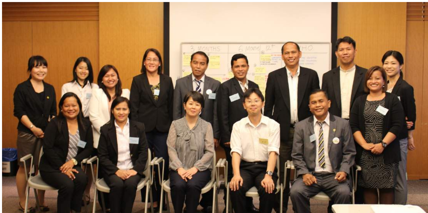
Group photo of the Core Team with SEEDS Asia and Hyogo BoE at JICA Kansai