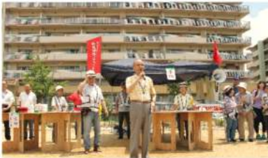
Community organizing for DRR (Kesennuma)

In the affected area of Great East Japan Earthquake and Tsunami, particularly in Kesennuma, SEEDS Asia is implementing community development funded by the Osaka Community Foundation and support for promoting DRR Education in line with Education for Sustainable Education funded by United Methodist Committee on Relief (UMCOR) and Church World Service (CWS), Japan. Community development includes organizing events as an opportunity for residents of temporary housings and reconstruction housings to strengthen the bonds with each other. Also, SEEDS Asia is giving advice on establishing a community DRR management group and utilized its network to provide an opportunity for the group members to visit Kobe and observe their pioneering activities.