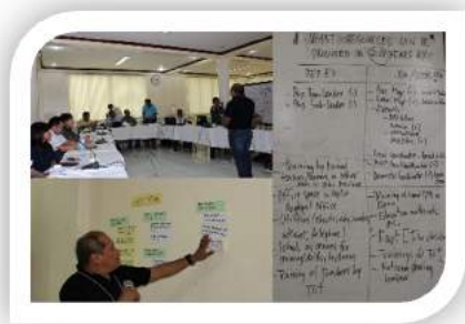
PDM Workshop with DepEd RO7, JICA Philippines and SEEDS Asia

were asked to answer the Knowledge Test to check the level of their awareness on various DRR concerns. Likewise the same test was administered after the said training to assess the information they have gained. To level-off their understanding, a lecture on DRR terms and concepts was presented including the Philippine law on DRR (Republic Act 10121), the Hyogo Framework for Action (HFA) and the Thrusts and Policies on DRR Education of DepEd.