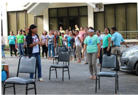
Sports Festival activities experienced by the teacher participants