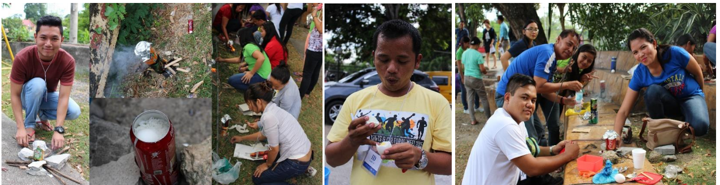
Emergency cooking activity conducted by the teachers using soda cans with rice and egg as the food cooked