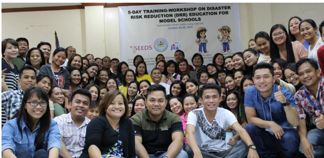
Group photo of 72 Model School Teachers with SEEDS Asia and Core Team members