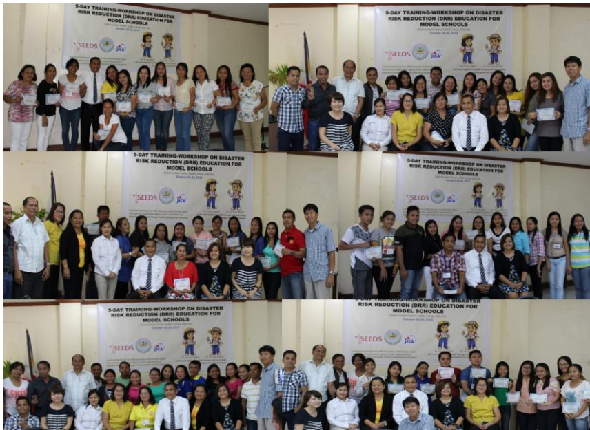
Presentation of Certificates of Participation