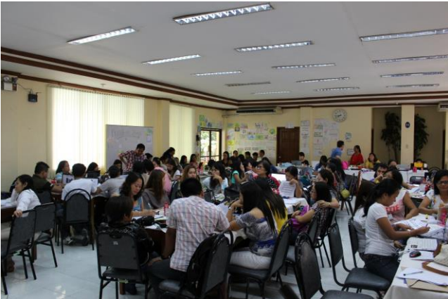
iPlan Writing Session of Teachers

Day 5 of the 5 days Training-Workshop of DRR Education Model Schools wherein selected teachers presented the 1 st draft of their iPlans with integrated DRR Education Activities. Closing Program was conducted by providing Certificates of Participation to all the teachers that completed the capacity building training workshop for DRR Education.