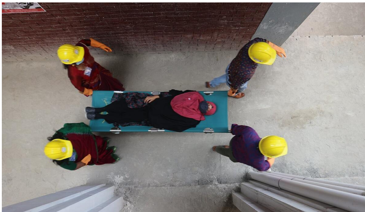
Practicing transportation of injured person during search and rescue training [Bangladesh]