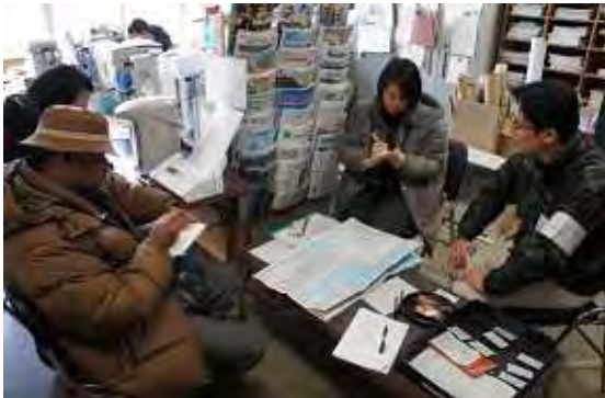
Figure 13. Meeting with person who is in charge of community FM

have various needs to survive in disaster situation. FM has the possibility to solve this problem. Figure 14 shows the radio booth on the air. The girl who is on the right side is fifteen years old. If the disaster did not happen, she would enter high school this April. But the government cannot start schools. Therefore, she came there and contributed to FM broadcasting. Generally, the role of new FM station in disaster situation is to make recovery smooth. Actually, the license of FM station was given for three month. Ofunato city consists of coastal/plain area and mountain area. In Iwate prefecture, damages by earthquake are not much. It means most of the damages were caused by the tsunami. Therefore, houses in the mountain area are not damaged severely. He mentioned the gap of people's awareness between two areas as future expected problems in this city. His aim of the FM is community development through the FM as well as disaster recovery/reconstruction.