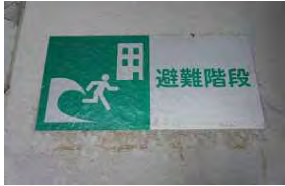
Figure 7. Evacuation building [8 storey building with evacuation more than 4 th floor]