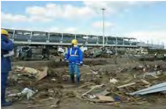
Figure 23. Damages around the airport

This place is a temporary evacuation place for Tsunami but this hill was also attacked by the tsunami. Figure 25 is the memorial thing for the tsunami this time. Some survived people visit this hill to pray. Figure 26 is the memorial stone for the tsunami caused by Syowa Sanriku Earthquake in 1933. The history of that tsunami was mentioned on the stone, as is described that the earthquake occurred at 2:30am on 3 rd of March, 1933, followed by the roar of tsunami in 40 minutes, be aware of tsunami after earthquake. The stone was established on the hill in November 1933, 8 months later of the tsunami but flowed by the tsunami. It was considered that local community people visited the hill and knew the past tsunami there before the tsunami and their awareness had been raised. But, the tsunami this time was much larger scale than the past one.