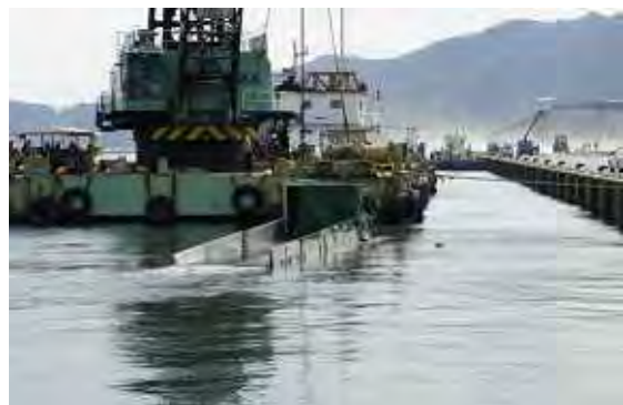
Figure 6. Destroyed truck is lifted from sea in Miyako