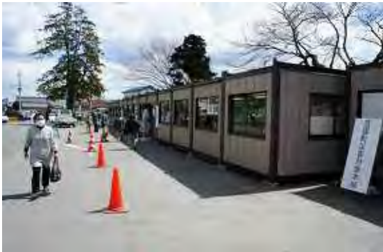
Figure 18. Temporary government office

could establish FM station smoothly. The person at FM station told the situation in this town. In disaster situation, the community wireless system to provide local community with tsunami warning was out of order. It is one of reasons to increase human damage in this town. Additionally, recent houses have high performance of noise barrier. People can not hear announces from the system when they are driving cars. Because of these reasons, the wireless system is not appropriate for the current life style. As another issue, she pointed the cost to prepare the same kind of wireless system again in this town. It is expected that cost for it is higher than cost to distribute radio to all persons in this town. She pointed out that local government should provide warning through radio in emergency situation.