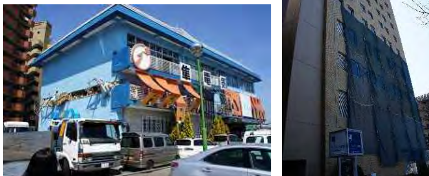
Figure 27. Building damaged by the earthquake

For house, clay tiles on roofs were damaged. Some large scale building in Sendai city had damages on the structure (refer to Figure 27). However, completely destroyed houses or buildings could not be seen in the both prefectures.