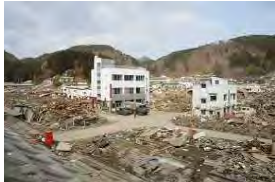
Figure 4. Buildings which survived during the tsunami in Taro area