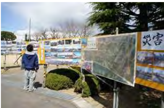
Figure 21. Information on damages and recovery works which were provided by the government

In Iwanuma city, the local government is providing information the damages in the city and government recovery work in front of the government building (refer to Figure 21). The government can this kind of works because the building was safe to the officer can concentrate to recovery works. From this, it is obvious that the government building is important. The survey team visited the office of the social welfare council in this city. The social welfare council is also working effectively. The council coordinates volunteers who came to this city. The staff told external help is not so necessary for coordination works but some recovery works like removal of clay or mud and house moving needs more volunteers (refer to Figure 22).