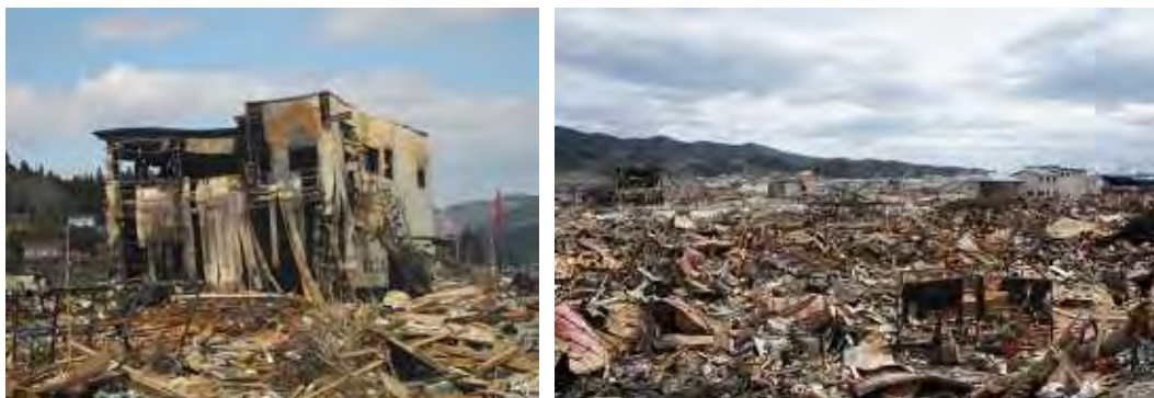
Figure 15. Damages by tsunami and burnt areas

Kesennuma city is severely damaged. In this city, heavy oil was flow out and it was burned. Therefore, many burnt pieces of rubble are seen in the city (refer to Figure 15). The city was devastated. Train could not run in this area because rail tracks are also damaged (refer to Figure 15).