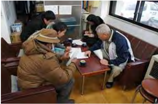
Figure 9. Meeting with social welfare council