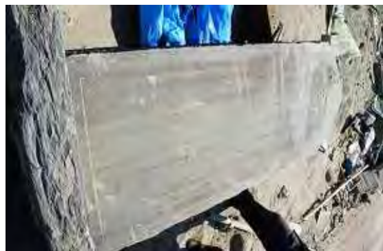
Figure 26. Memorial stone flowed from the hill