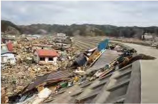
Figure 3. Damages by the tsunami in Taro area