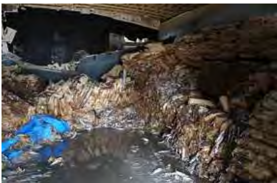
Figure 5. Damages to frozen fish in Miyako area