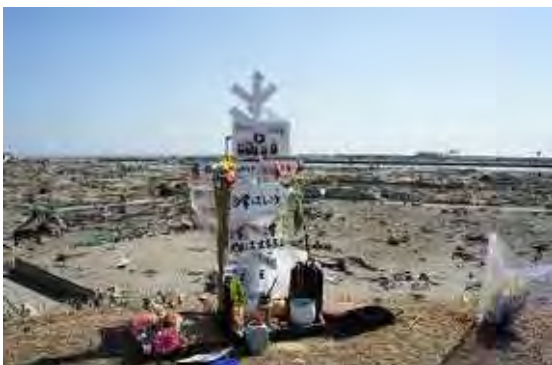
Figure 25. Memorial things on the hill