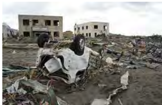
Figure 12. Damages by the tsunami