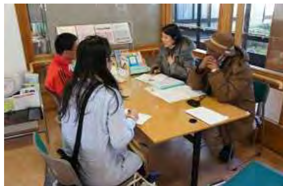
Figure 22. Meeting with social welfare works