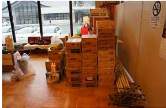
Figure 10. Inside of social welfare council