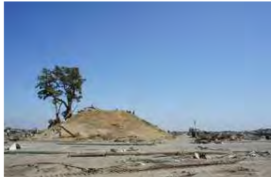
Figure 24. Hill for tsunami evacuation in residential area