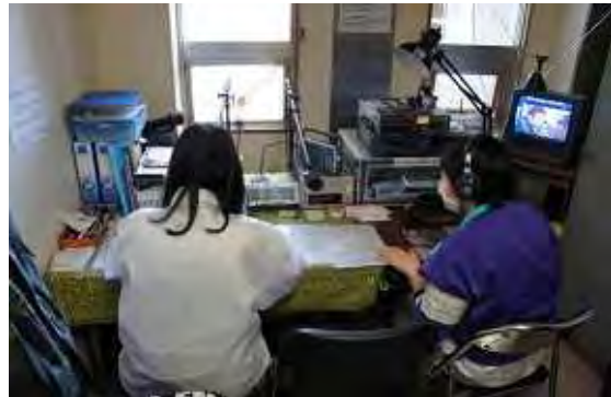
Figure 14. High school student giving message through FM