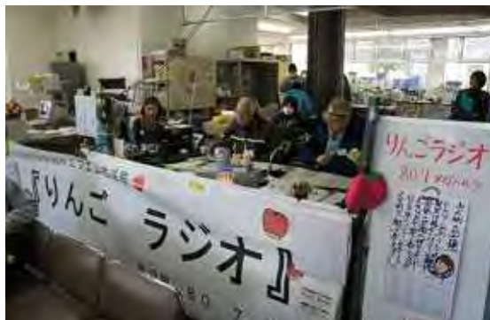
Figure 17. Town mayor giving message or explanation on the town through FM