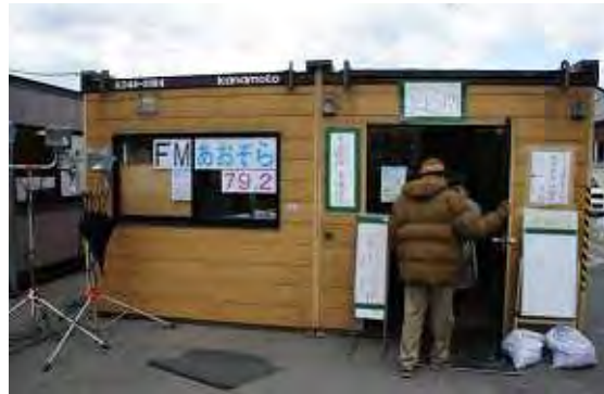
Figure 19. Community FM station

One of the big problems in tsunami affected area is how house rubbles is demolished earlier to start recovery and reconstruction works. Under the general government works, house owner asks the government to demolish. But the government has more works in emergency situation, compared to general time. In Watari town and other city/town, house owners can express their decisions on demolition, using the flags (refer to Figure 20). House owners select one of color flag from three flags and give it to their own house. Red means houses and rubbles round house can be demolished by the government or appointed companies. Yellow means only rubbles around houses can be demolished and green shows any demolition is not necessary. Because of this, it is easy to understand house owner's decision and the government can start recovery works earlier. This system has an advantage because the local government respects house owners' decisions with flexibility. At the beginning, house owners can choose green flags, however after searching for their belongings in the rubbles in and around their own houses, they can change the green flag to yellow or red flags.