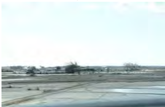
Figure 16. Damages by the tsunami

Yamamoto town was heavily damaged by the tsunami because it is located in plane area (refer to Figure 16). But the government building was remained. In the first floor of the building, FM station was established. The roles of the FM station were similar to that of Ofunato city. The person who is in charge of management of FM station is a person who retired from TBC (Tohoku Broadcasting Company). He moved to live in this town after his retiring. Because he was an announcer in TBC and had several connection due to his working history, he and local community could establish FM station. He has similar aims on FM station which the person in Ofunato city has. The FM station invites government persons including the town mayor and asks them to announce the current status and future plan for recovery and reconstruction (refer to Figure 17). As mentioned before, the person who is in charge of the FM station emphasized the radio should be utilized for community development as well as prompt and appropriate recovery and reconstruction. Inviting the government persons is one of challenges to achieve it. Because of this challenge, FM station can make the linkage between local community and the government. He is considering that FM station would be able to be continued for community development if the local government understands the importance of FM station.