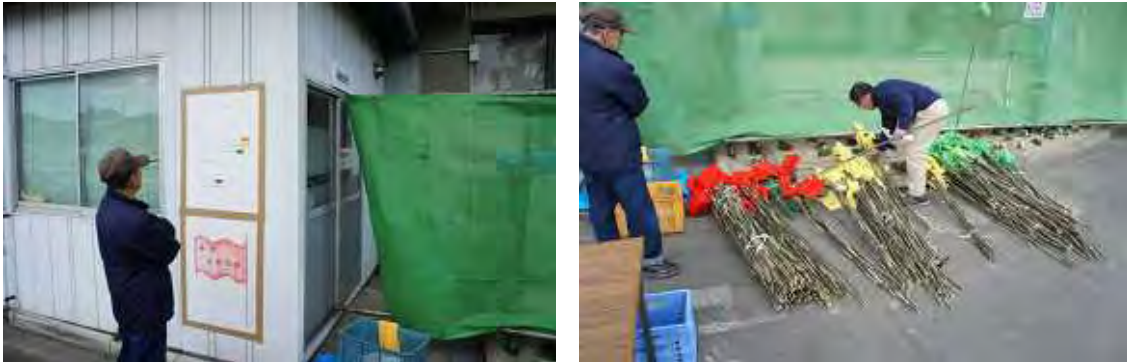
Figure 20. Three kinds of flags to show the house status