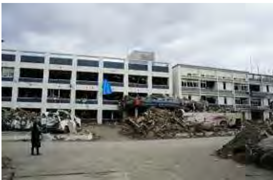
Figure 11. Damaged local government building

This city was devastated. Figure 11 is the government office building and Figure 12 is the surrounding area of the building. The government office building is damaged and it is possible for the government to work there. It is expected that all of documents, facilities, and equipments were severely damaged. Around the government building, most of houses and building were flowed. It is difficult for local people even to find their own property or belongings.